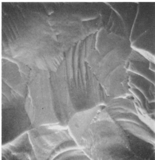
Figure 1 Intragranular fracture of irradiated uranium dioxide showing both discrete fission gas bubbles and "river patterns" characteristic of cleavage ( \times 1600 ).

to 1750° C. Sections of thickness 1 mm were fractured and the freshly fractured surfaces coated with an evaporated layer of aluminium. The specimens were examined at 30 kV using a current of 200 \mu\text{A} . Typical micrographs are shown in figs. 1 to 3. Fig. 1 shows the structure at a calculated temperature of 1200° C and at a burn up to 10^{26} fissions/m 3 . This is a typical cleavage fracture and is characterised by the "river patterns" on the fracture faces; a small amount of grain-boundary porosity can be observed. Fig. 2 shows the nature of fission gas bubbles on a grain face after irradiation at 1600° C to a burn up to 10^{26} fissions/m 3 . This micrograph illustrates stages of bubble linkage. Thus we have discrete bubbles in the range 0.5 to 15 \mu\text{m} diameter together with larger bubbles formed by the coalescence of two or more bubbles. An interesting feature in fig. 2 is the association of gas bubbles with particles; these are thought to be precipitates of solid fission products. Fig. 3 shows the structure at an estimated temperature of 1500° C after a burn-up of 5.4 \times 10^{26} fissions/m 3 . The grain faces have numerous fission-gas bubbles in the range 0.2 to 2 \mu\text{m} . Gross bubble linkage has taken place along the grain edges to form "tunnels". The amount of gas per unit area of boundary was